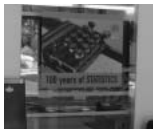
Views of the ABS display at Parliament House which ran during February and March 2005 to commemorate the ABS Centenary.

In 2005 the Australian Bureau of Statistics celebrates its centenary, 100 years as the national statistical agency.