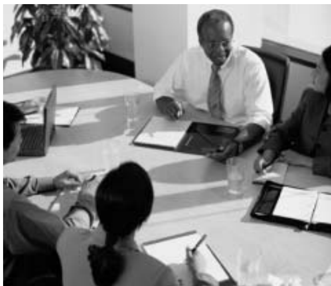
Analyse and describe data that has been collected in surveys.

The course is best suited to people involved in using data to produce a report or social commentary, or with analysing and describing data that has been collected in surveys or through administrative processes.