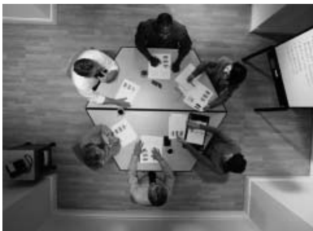
Group activities are a great way to put what you learn into practice.

This course would be useful for ABS datacube users and AusStats subscribers who have little or no experience with SuperTABLE .