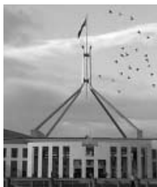
Parliament House, Canberra

Initially the role of the Commonwealth Statistician was primarily seen as a co-ordination role, bringing together the statistics of each of the different states. However it quickly became clear that the task was somewhat more complicated than that. In 1924, Tasmania was the first state statistical office to integrate with the Commonwealth Bureau. The rest of the state statistical offices integrated in the late 1950s.